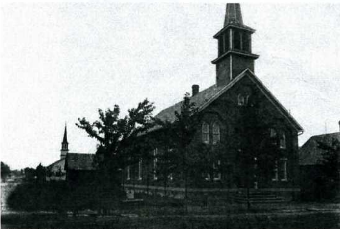
The old German Methodist Episcopal Church at the corner of S. Main and W. German St.