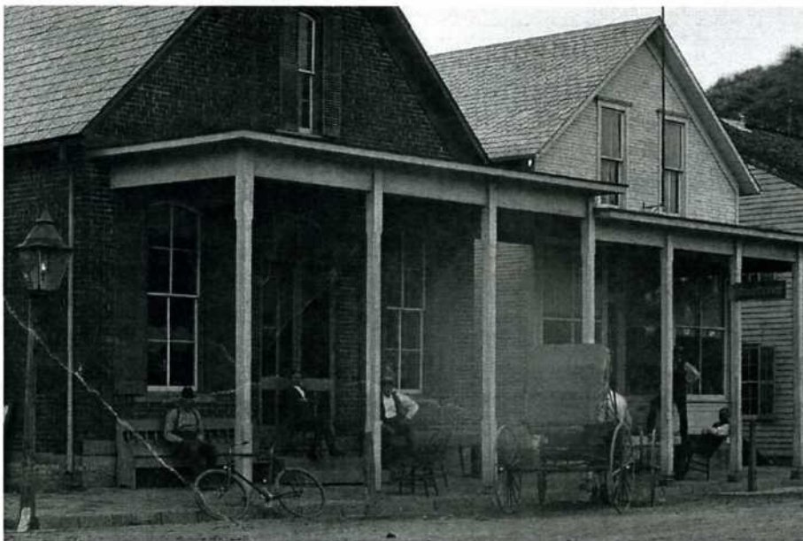
The old Kuhlman Store and Post Office at the corner of N. Main and W. Spring St.