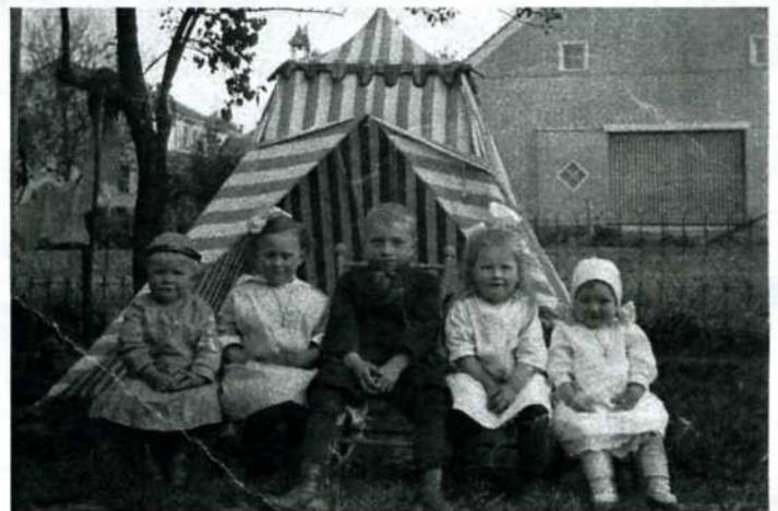
Children at Play