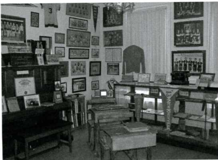
The school room is one of five rooms in the Heritage Museum available for viewing during the open houses.

The remaining open house dates are the last Sunday of the month: June 28, July 26, August 30, September 27 and October 25. Please join us for these enjoyable events. Everyone is welcomed.