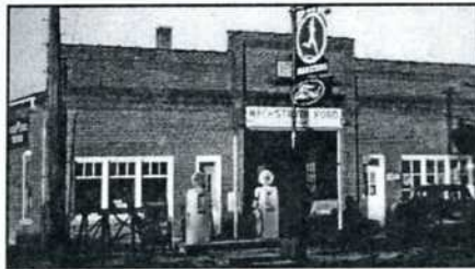
Meckstroth Garage at its present location in 1950's.