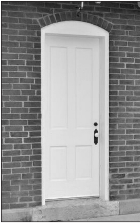
The back door to the doctor's office was painted by Todd Spieles.