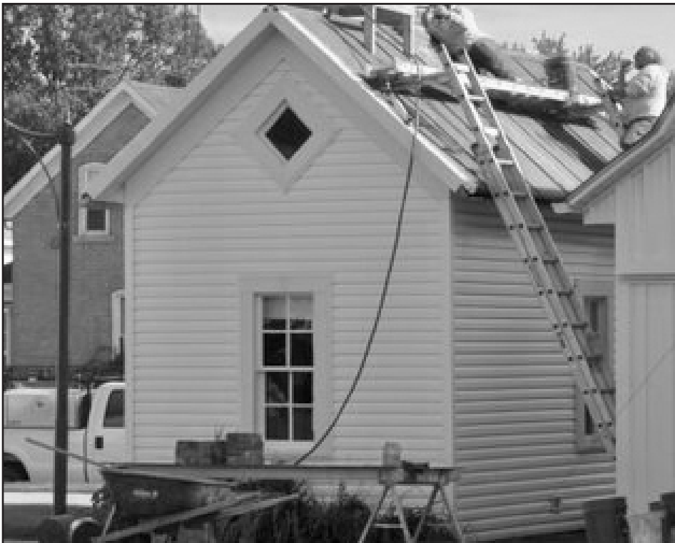
The house's summer kitchen proved to be the most work. The original windows were cleaned, painted, and restored. The chimney was removed

any deteriorated wood in the soffit, doors and storm windows.