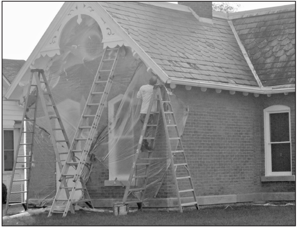
The doctor's office also required spot priming and two coats of paint as well as cleaning and repairing

any deteriorated wood in the soffit, doors and storm windows.