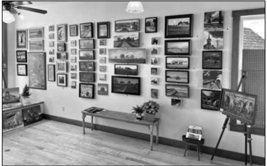
The photo above shows the artwork that was on display inside the barbershop at the September open house. In addition Wietholter painted several historic buildings and homes in the village that were then turned into Christmas cards by Sara Paper of Minster. The floor was refinished by Henschen Hardwoods.