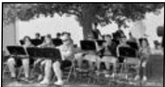
The New Knoxville band played at the open house held in September.