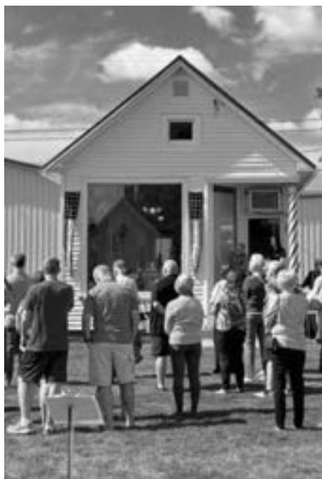
The Kattman barbershop, which was moved to the historical society grounds in 2022, was on display during the September open house.

The object of the New Knoxville Historical Society, according to the constitution, is the discovery, collection, preservation, restoration, acquisition by purchase or by gift and ownership of historical objects and memorabilia