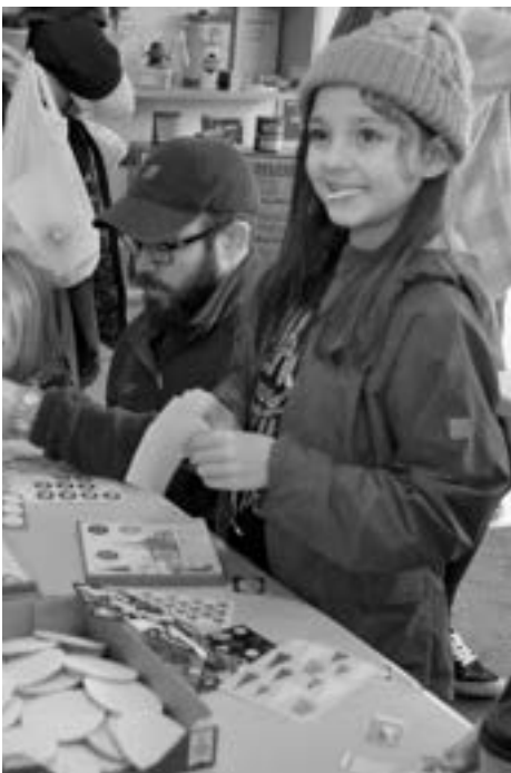
Children and adults as well enjoyed putting stickers on the ornaments they took with them.