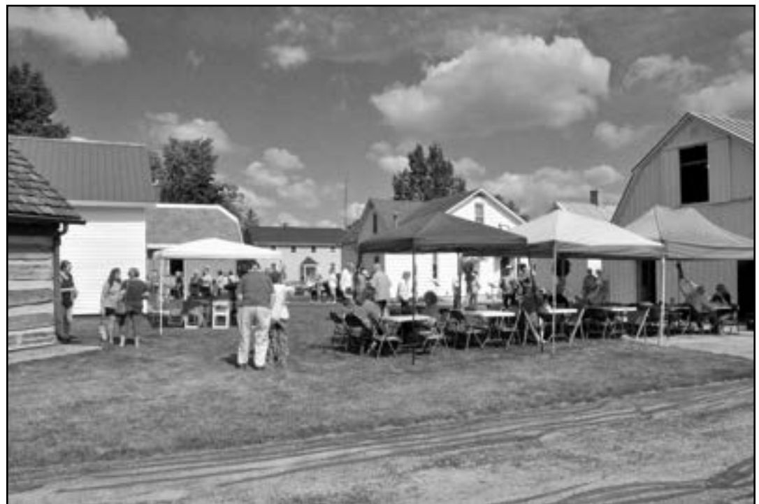
All of the buildings were open for the September open house, and tents and tables and chairs were provided. A food truck from Grandma's German Kitchen was out front so people could eat and enjoy the festivities of the day.